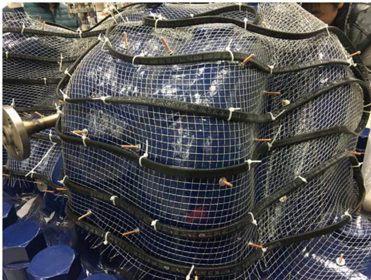
Temperature maintenance of fluid storage vessels with SANTO XPI tracing cable.